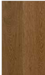
0580 BROWN SUGAR