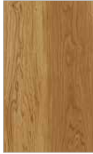
0510 SUMMER BLONDE