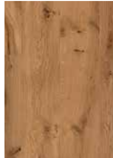
510 Summer Blonde