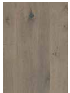
780 Silver Finch