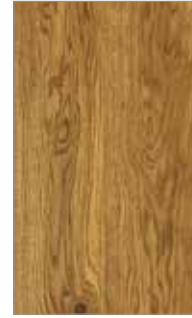
0535 WILD FAWN