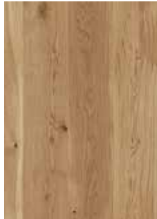
500 Alpine Oak