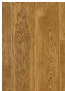
535 Wild Fawn