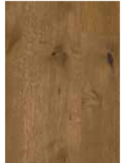
520 Autumn Amber