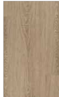
7001 SILVER BELL