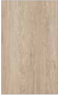
1001 GREY MIST