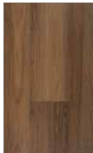
0555 QLD SPOTTED GUM