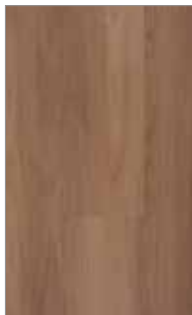
0545 COASTAL BLACKBUTT